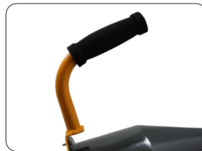
Special grip system that does not tire and sweat the hand