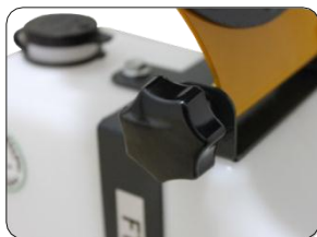
Adjustable up and down angle system