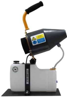
Provides light and compact structure and ease of use