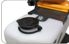
Tank cap designed for easy filling