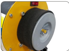
Easy to clean air filter system