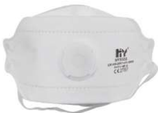
9332 - FFP3 NR D