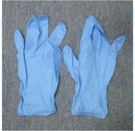
Samples of gloves described as Medcare examination gloves, powder free, color blue. Reference No. MD0120