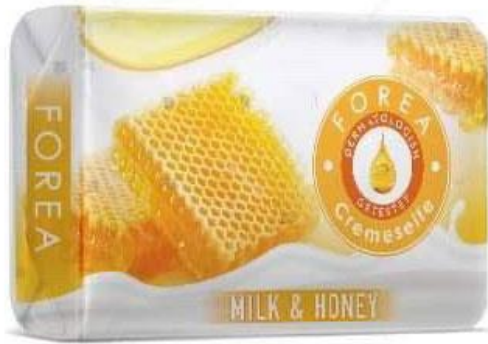
Forea Cream Soap Milk & Honey

The solid soap has a pleasant, delicate scent of honey and gently cleanses the skin. The hands feel noticeably smoother.