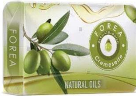
Forea Cream Soap Natural Oils

The classic soap with the care of high-quality olive oil.