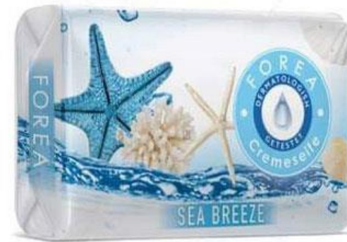
Forea Cream Soap Sea Breeze

Gentle cleaning for the hands. Experience a fresh breeze and a velvety soft feeling on your skin.